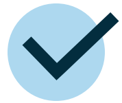
Chart out your current profiles